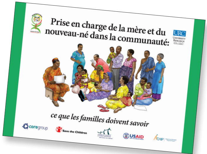
The newly adapted “Taking Care of a Baby at Home After Birth” flipbook.

CORE Group engaged University Research Co., LLC to translate the flipbook into French and to adapt the content to the Benin context. URC-CHS has worked in Benin for over 12 years, implementing USAID Integrated Family Health Projects, child survival projects and quality improvement activities. The highly skilled in-country staff includes physicians, midwives, and community health experts. URC has company-wide job aid expertise. Over the past decade, URC has introduced, tested and adapted a variety of evidence-based tools to help health workers or caregivers in low- and middle-income countries perform health tasks and behaviors better. By supporting adaptation of the material to meet local need, CORE Group and URC sought to provide guidance to other countries and programs that might want to adapt the material.